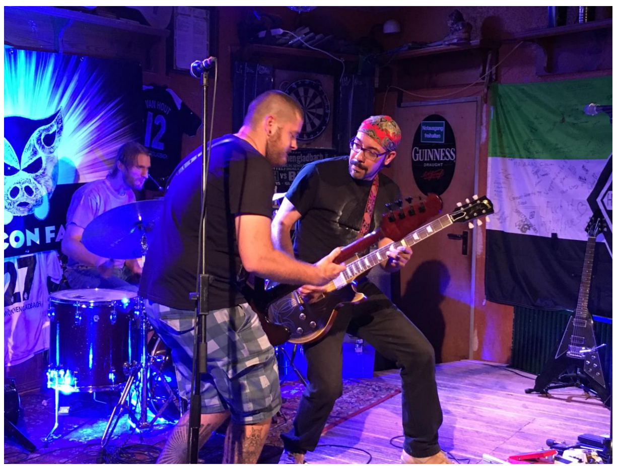
POGS, Rheydt, Mönchengladbach (GER)