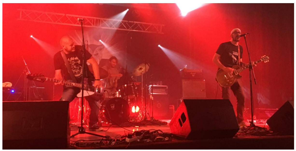
Maison du Peuple, Flémalle