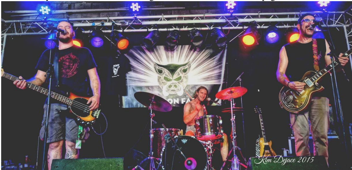
Rockin' the Nandrin festival - August 30th, 2015

During July and August Bacon Fat played some more shows (including the very first gig in Ghent, semi-acoustic) but the highlight of the year was the gig at the Deux Ours Nandrin Festival on August 30th. It was right in the middle of the recording sessions of the ' Band of Brothers '-album and showed a band that was in full progression. That show was shot on camera and you can see some of the songs on the Bacon Fat YouTube page.